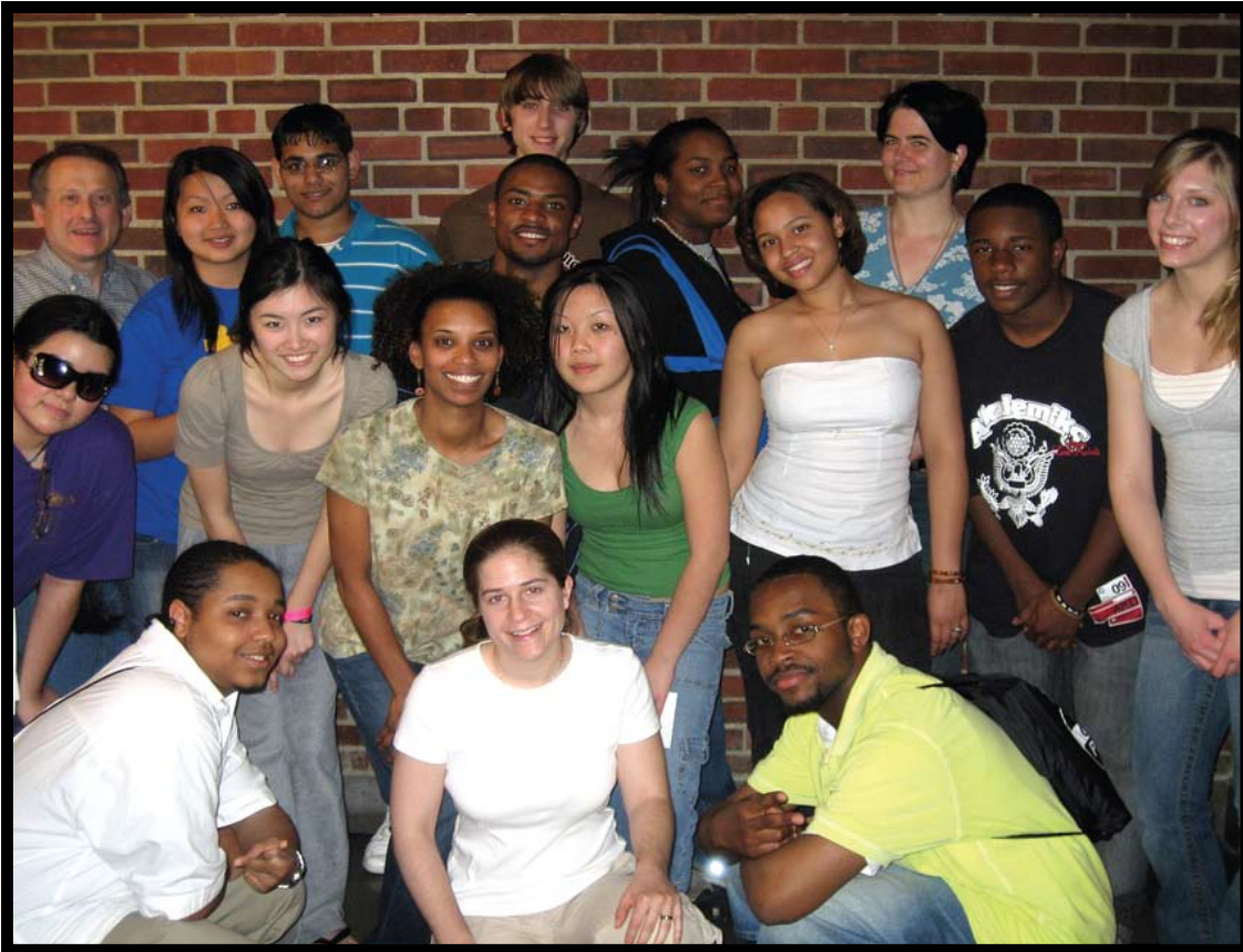
Metro-Detroit youth who participated in the Youth Dialogues project, and have dreams to share.

—From “My Dreams Are Not a Secret,” a collaborative poem by the Detroit Youth Writers.