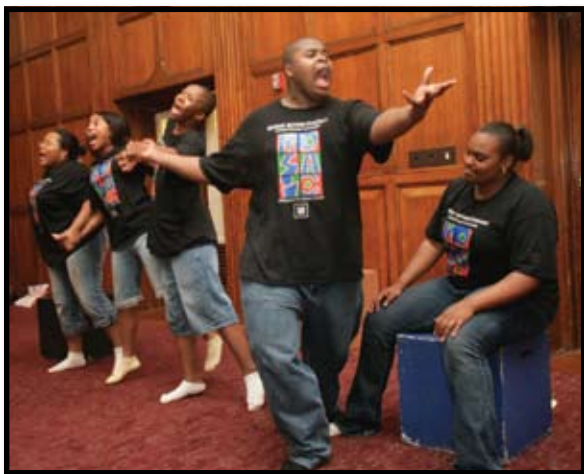
Mosaic’s “Speak for Yourself!” being performed by members. A series is in the works for a public television broadcast.